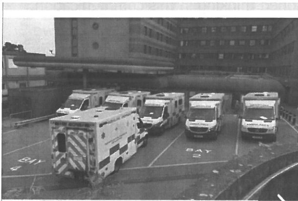
📷 Ambulances wait outside the accident and emergency department of the Royal Gwent Hospital in Newport on July 7, 2019. Six ambulances are visible in the picture with another four waiting in another part of the car park